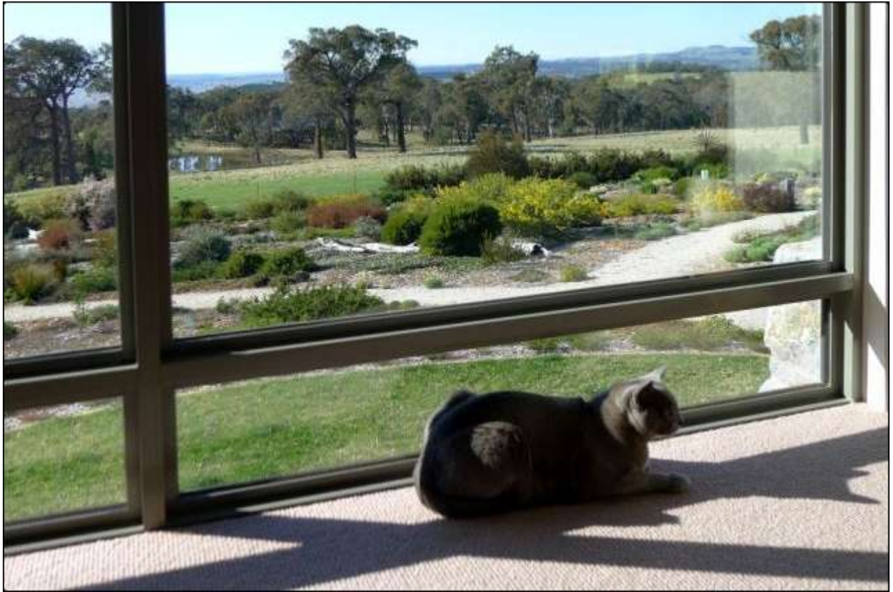
2012 spring. View south east from my favourite chair