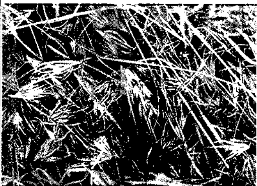
Kangaroo grass ( Themeda australis ) seedheads

Whether it's the bold tussock texture of Alpine snowgrass or spinifex in the Pilbara, native grasses are an essential part of the Australian landscape and can bring unique texture and effect to home gardens.